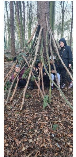
Year 6 had a fantastic time at CHET last week.