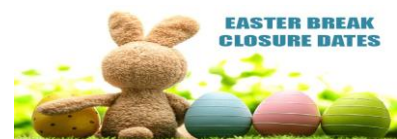
EASTER BREAK CLOSURE DATES

'Find out where joy resides, and give it a voice far beyond singing. For to miss the joy is to miss all.'