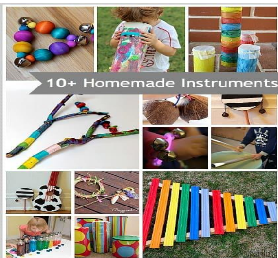
10+ Homemade Instruments