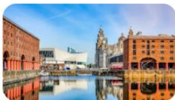
Royal Albert Dock Liverpool