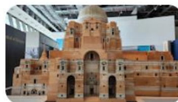
Museum of Liverpool